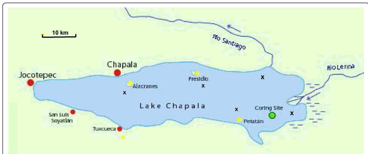
Figure 1 Map of Lake Chapala and Study Locations. Suspended particle sampling sites are shown as x's and named (Table 4) for nearby rivers (Lerma and Santiago) or islands.

Samples of fish from Lake Chapala, including commonly consumed carp, charales (whitefish), and tilapia were obtained by purchase from local fishermen who were observed catching the fish from the lake. The samples were originally stored at 0-4°C, but warmed to ambient temperature during the two-day transport to Rensselaer Polytechnic Institute (RPI). Subsequent testing (see Table S-2, Additional file 1) indicated that such handling does not significantly affect total mercury concentrations. Samples of skinless filet from tilapia and carp as well as headless, eviscerated charales, typical representations of "edible portions" of the respective species,