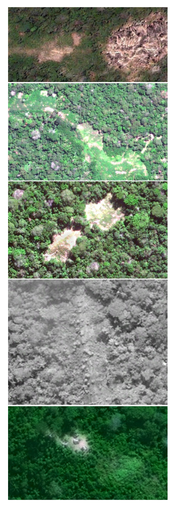
Figure 1. Satellite images of clearings and houses for sections of the five sites. From top to bottom are sites X, H, M, F1 and F2.

factors including the difficulties associated with clearing trees using traditional technologies, the degree of traditional housing and subsistence, and the age of communities. Traditionally, tree cutting was done with stone axes which is extremely time consuming [21–24]. FUNAI gave steel machetes and axes to isolated populations for decades (this practice has since been discontinued in this region), and they have